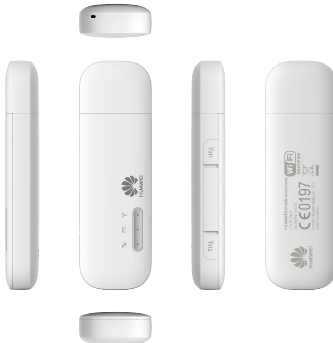
Figure 1-1 E8372 profile

Figure 1-1 shows the profile of the E8372.