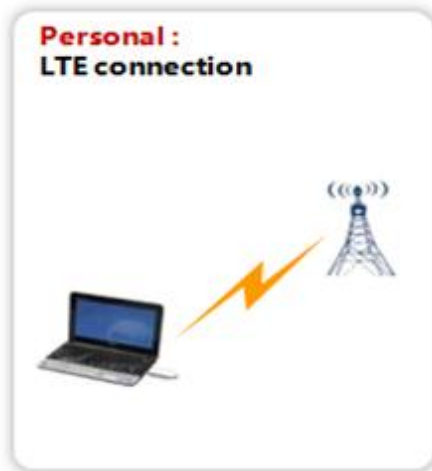
Figure 3-1 shows the device connecting to the network by USB.

After you connect the E8372 to a PC with the USB interface, you can send or receive E-mail, access the network through wireless connection, and download files through wireless data channels.