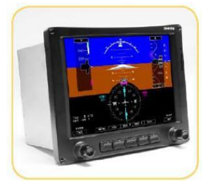
UAV Flight Control Uncertified Avionics

The ACEINNA VG380SA integrates highly-reliable MEMS 6DOF inertial sensors with extended Kalman filtering in a miniature factory-calibrated module to provide consistent performance through the extreme operating environments in a wide variety of dynamic control and navigation applications.