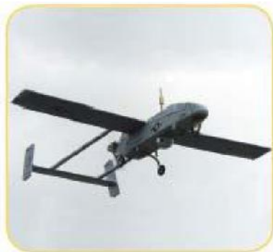
UAV Flight Control