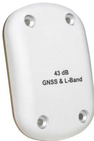
Trimble AV37 Antenna

Mapping and surveying from the air using GNSS requires survey grade antenna technology in a compact and reliable form factor. The Trimble AV37GNSS Aviation antenna achieves this without compromising performance.