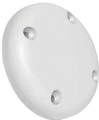
Trimble AV34 Antenna

The antenna is an aviation type of design. The bulkhead mounting ensures only the rugged radome is exposed to the elements. This is an ideal design for customers building machine control systems. The antenna can be mounted flush with the vehicle surface or on the top of a pole mount. The TNC connector is located on the underside of the unit ensuring the attached cable is also protected from the environment.