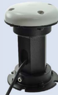
Antenna shown with optional bracket. Bracket allows for mounting on single center 5/8 bolt or four perimeter bolts.

Specifications subject to change without notice.