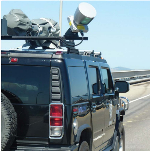
HDL-64E mounted atop mapping collection vehicle. 360° sensor rotates up to 15 Hz.

The HDL-64E S2 provides high definition 3 dimensional information about the surrounding environment.